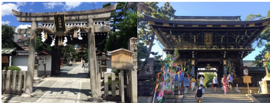
Figure 1. Torii gate on the left (Daishogun Hachi Jinja Shrine), romon on the right (Kitano-Tenmangu Shrine).

Sacred architecture serves the purpose of delineating the sacred from the profane, differentiating sacred space from the rest of the world (Humphrey & Vitebsky, 1997; Hutterer, 2015). This delineation occurs by using iconography and symbols that represent the concepts of thresholds and sacred boundaries. For Shinto shrines, this philosophy is embodied in the torii gate (see Figure 1), which serves as a portal from the ordinary to the sacred space of a shrine (Ono & Woodard, 1963). In addition, there are the romon , which are large gates that mark the entrance to the main shrine, again reminding the worshipper of the delineation of sacred space from secular.