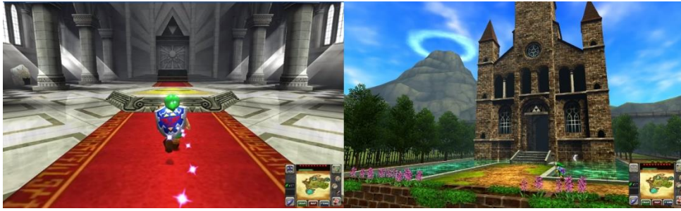
Figure 7. The Temple of Time interior (left) and exterior (right).