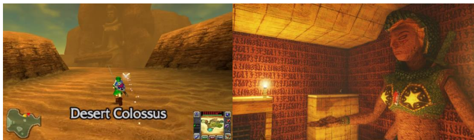
Figure 5. The Goddess of the Sand outside the Spirit Temple in OoT (left) and its sister inside the dungeon (right).

The Spirit Temple appears to be stereotypically Middle Eastern. Visually, it contains iconography of desert civilizations and ruins, reminiscent of Tibetan Buddhism. A likeness of the Goddess of the Sand is carved into the mountain outside of the Spirit Temple, and the dungeon itself is a literal cave hewn out of the sandstone (see Figure 5). The Goddess of the Sand can be read as an interpretation of the image of Buddha, as she is sitting with crossed legs and arms outstretched in a meditative position. These figures are also shown with a serpent wrapped around their neck and enveloping their head.