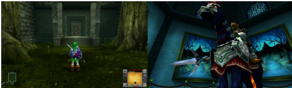
Figure 6. The Forest Temple's entrance (left) and the boss room (right), with Classic-inspired architecture.

The boss room in particular holds much iconography related to Western art history (see Figure 6). It is an octagonal domed room (like a basilica), with stained glass windows and upon each wall there appears to be an oil painting. 4 The boss room can be interpreted as a Western art gallery. While this room reads more like a hall of Christian worship, the artefacts on the wall—presenting a scene of a decrepit and ghostly path—conjure a stronger association with the literary genre of Gothic. 5