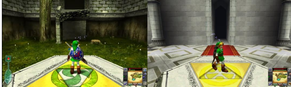
Figure 2. Triforce pedestals in OoT . Screenshots by the author.

These features are also found in the virtual architecture of OoT 's temples and serve the same purpose. Outside of every temple are large, hexagonal pedestals (see Figure 2). While these pedestals serve a ludographic purpose (fast travel), they also are similar to the torii and romon gates in that they are reminders that the player (or worshipper) is crossing a threshold and entering a mystical or sacred space.