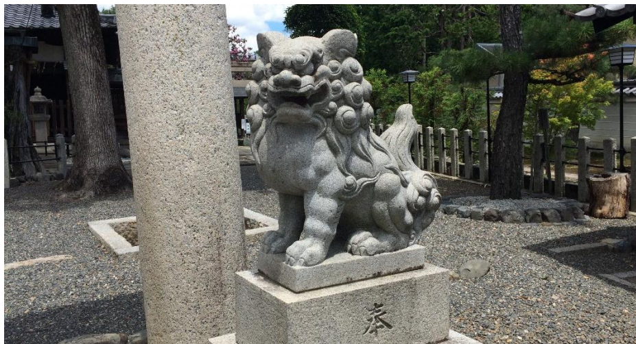
Figure 3. A komainu at the entrance of the Rokusho-jinja Shrine.

Another recurring element of the dungeons in OoT is the presence of twin guardians at the entrance. At the entrance of the Forest Temple there are two Wolfos , Jabu Jabu's Belly has two Octoroks , and the Spirit Temple has two Flying Pots . This mirrors the iconography of Shinto shrines, with their komainu . Komainu are guardian dogs that come in pairs and are placed on each side of the main entrance to a shrine (see Figure 3). These spiritual guardians are symbols that demarcate the sacred space of the shrine.