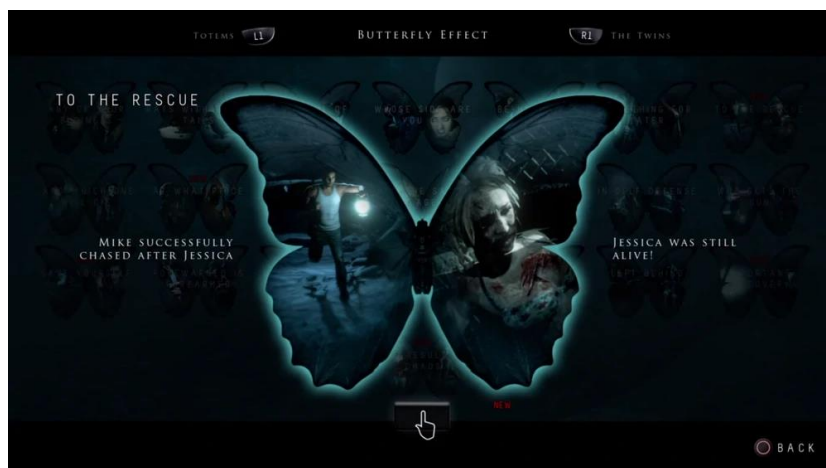
Figure 1. Example of Until Dawn's butterfly effect game mechanic.

The game is built around the concept of the "butterfly effect" (see Figure 1) and the choices players make determine which characters survive or die. Players are alerted precisely when they make a decision that alters the course of the narrative. According to Tavinor (2017), "some of the butterfly effects in the game are rather distant from their initiating actions, and a decision made much earlier in the game can have a surprising effect later on. As a result, it is often a puzzle to understand the causal structure of the game's narrative algorithm" (p. 26).