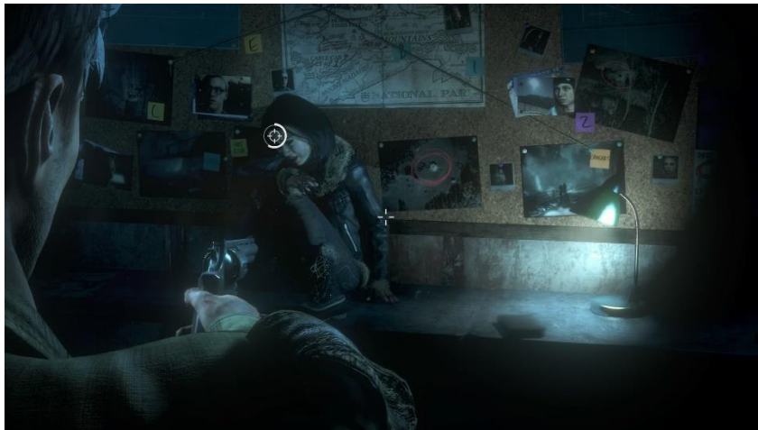
Figure 3. The player/Mike is given the option to shoot Emily in Chapter 8.

According to the value pluralism model, higher levels of integrative complexity are connected to conflict (Tetlock, 1986), and according to McCullough (2019d), higher levels of integrative complexity are associated with higher levels of agency. Characters that are more active within their narratives appear to be more linguistically complex than more passive characters. This may explain why the male characters in Until Dawn are more complex than the female characters.